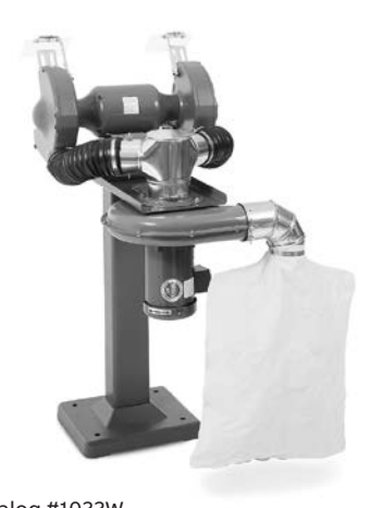
Catalog #1022W with DC10 and GA16 (sold separately)