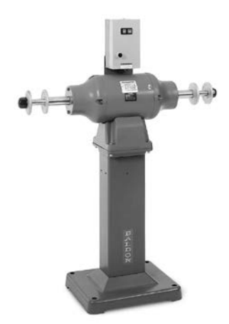
Catalog #1458 with #GA20 Pedestal (sold separately)

Buffers are designed for use with soft cloth wheels only. Specific buffing applications may require the addition of operator safety devices. Consult with a safety engineer before installation. Price includes flanges and nuts but does not include wheels.