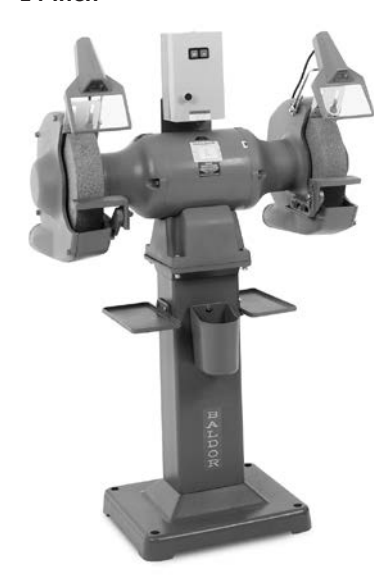
Catalog #1407W with #GA20 Pedestal (sold separately)

Cast iron tool rests & exhaust type wheel guards.