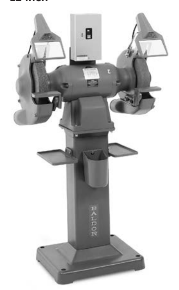
Catalog #1215W with #GA20 Pedestal (sold separately)